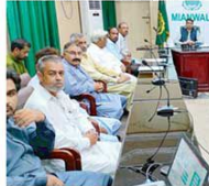
District Emergency Response Committee. He directed district and thesil level officers of all government departments to continue regular visits to dengue hotspots.

these instructions while presiding over a meeting of the