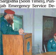
Sargodha (Soon Times), Punjab Emergency Service Department Rescue 1122 Sargodha will be on high alert

during Muharram. District Emergency Officer Mazhar said, all the A and B category majlis and processions in the district and all the thesils will be provided complete rescue cover. In this regard, 519 rescuers, 39 motorbikes, 29 ambulances, 5 fire vehicles and 2 rescue vehicles will perform duty along with Muharram processions. Along with this, 8 rescue posts have been established which will provide rescue services to the victims in any untoward situation.