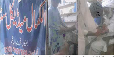
nagar has plenty of quacks. with human lives. Middle and

Matric Fail quacks have opened their own hospitals, medical stores and clinics. The officers of the health department have allowed them to work by taking money. Local people have demanded CO Health Bahawalnagar and Deputy Commissioner Bahawalnagar to immediately seal the clinics of middle and matric failed doctors who are playing with human lives and take strict legal action against them.