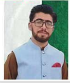
Written by: Altaf Kumail

to respond resolutely to their adversaries' conspiracies. Unfortunately, recent days have witnessed an alarming situation in Gilgit-Baltistan, marked by concealed strife and sectarian biases, resulting in protests staged at every street corner due to hatred and enmity. Once again, the serene atmosphere of Gilgit-Baltistan is being disrupted by sectarian discord, aiming to disrupt the peaceful environment through sectarian unrest. Regrettably, a trend has begun where whenever peace and tranquility need to be established in the region, sectarian differences are inflamed to create divisions between Shia and Sunni, leading to the erosion of unity and solidarity, serving the interests and objectives of those who seek to capitalize on the situation. Gilgit-Baltistan is a region of strategic significance, attracting both external and internal opportunistic elements,