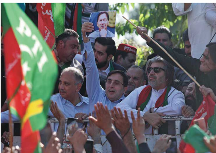
PESHAWAR, PAKISTAN, MAR 31: Activists of Tehreek-e-Insaf (PTI) are holding protest demonstration for release of Imran Khan, Former Prime Minister, at Peshawar press club

Prophet Isa (AS) and is a reminder to bring these in our daily lives to create harmony and peace in today's strife and conflict-ridden world," he said. He lauded the contributions of Christian community in struggle for the creation of Pakistan and its socio-economic development. He said he believed that they would continue to play their proactive role in the progress and stability of Pakistan. "While we celebrate diversity of faiths as a source of strength and enrichment in our nation, let us join hands towards building a society that is tolerant and cohesive and together defeat the forces of discord that are trying to cause harm to the fabric of our society. "We reaffirm our resolve to work for the social uplift and integration of all our minorities in Pakistan," he said wishing the Christian community a happy and peaceful Easter.