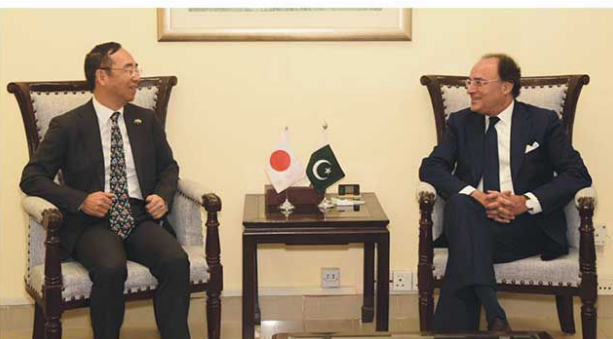
The Ambassador of Japan to Pakistan, H.E. Mitsuhiro Wada, called on Mr. Muhammad Aurangzeb, the Minister for Finance and Revenue, today.

of our country. If you are learning about a language, you will have to learn grammar, rules, and all the theory. Here, the problem is that, if you go abroad or be a part of an educated social circle, no one is, preferably, going to ask you to define the "verb". Instead, one's communication skills come into play. Henceforth, it's our duty as well as the responsibility of the government to be on the lookout for the fabricators and those who are just all hat and no cattle regarding teaching the language in consideration. Moreover, it is the foremost task of the administration of those institutions to hire teachers who are well-equipped with the tools and expertise to impart an impactful knowledge of the use of language. Since we have quoted "Eleanor Roosevelt" about hope in the beginning, we hope this problem will be dealt with with an iron hand.