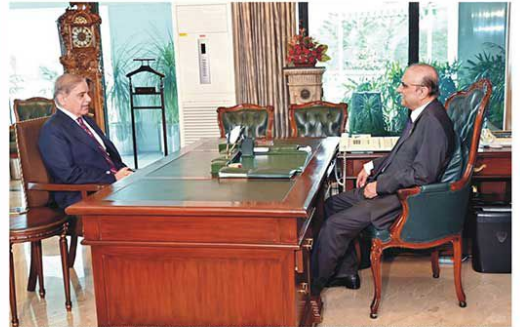
Prime Minister of Pakistan Muhammad Shehbaz Sharif called on President Asif Ali Zardari, at Awan-e-Sadr.