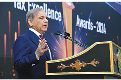
Prime Minister Muhammad Shehbaz Sharif addresses the ceremony of the Tax Excellence Awards 2024 in Islamabad on March 26, 2024.

Premier announces restructuring of FBR to increase tax revenue