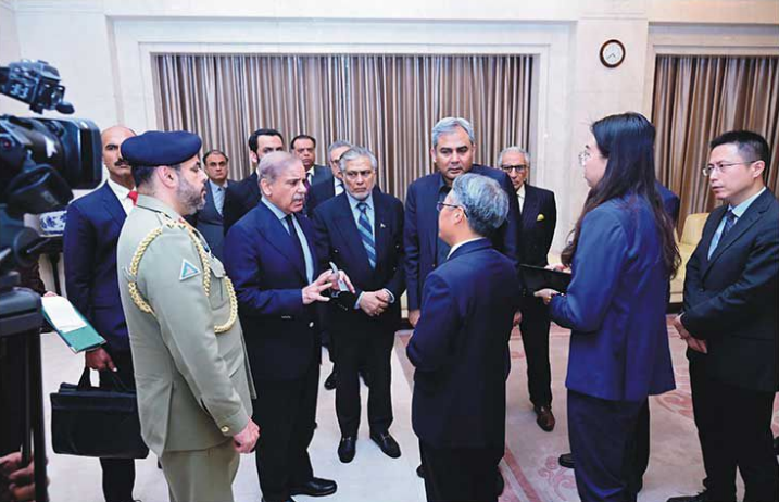
Prime Minister Muhammad Shehbaz Sharif visits the Chinese Embassy in Islamabad, and met with Chinese Ambassador Jiang Zaidong to offer condolence over the death of Chinese nationals in a suicide attack in district Shangla on March 26, 2024.

The distribution of Nigehban ration package to deserving families during Ramadan is a historic public service program benefiting millions of people. Commissioner Gujranwala said that at the cost of 30 billion rupees, in the history of Punjab, on the instructions of Chief Minister Maryam Nawaz Sharif, the Ramadan ration package is being delivered to the homes of the beneficiaries, which is a historic program of public friendship and public service. The Commissioner said that the implementation of other public welfare measures including the Chief Minister's Clean Punjab campaign will solve the basic problems of the people and give them relief. Cleanliness of urban and rural areas has clearly improved with the Clean Punjab campaign.