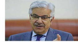
Pakistan, the country must keep all options open, he suggested, adding despite efforts, the Afghan government was not taking up the issue.

Soon Times Correspondent ISLAMABAD Defence Minister Khawaja Asif says fundamental changes are required to improve the border situation with Afghanistan. Khawaja tweeted that the Afghan soil was being used for terrorism in Pakistan. "Pak-Afghan border has a unique position in the world and it is different from other borders of the countries," said the defence minister. As Afghanistan government has failed to cooperate to stop terrorism in