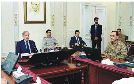
Prime Minister Muhammad Shehbaz Sharif chairs a high level security meeting in Islamabad

Nation had defeated nefarious designs of Pakistan's adversaries: COAS.