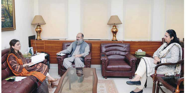
NCRC Chairperson Collaborates with Federal Minister for Commerce, Jam Kamal Khan to Elevate Child Rights Agenda and Boost Pakistan's Global Image in Islamabad on March 27, 2024.

application. Usman Dar's counsel requested the court to order the removal of his name from the list and direct the FIA to abstain from hindering his travel to Saudi Arabia. The court accepted Usman Dar's plea and directed the authorities to remove his name from the no-fly list to enable him to perform Umrah. Meanwhile, the LHC also accepted Usman Dar's seven-day protective bail in the GHQ attack case.