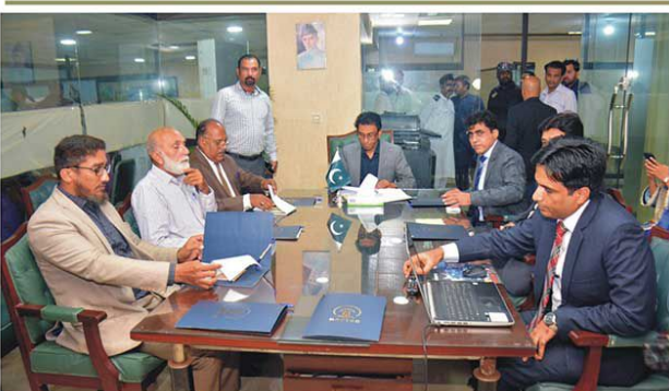
Hon'ble Dr. Khalid Maqbool Siddiqui Federal Minister for Education and Professional Training is being briefed by the NAVTC Regional office officials during his visit on 27 March 2024

"The index is currently looking poised to breach 66,000 this week and see accelerated gains," AHL said, adding that 58 shares rose while 33 fell with Fauji Fertiliser (+4.31%).