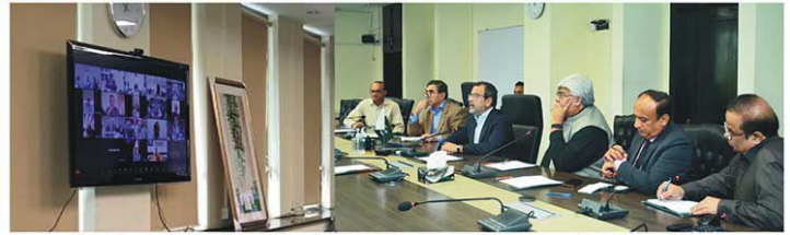
Federal Minister for Power, Sardar Awais Ahmad Khan Leghari addresses the CEOs and chairmen of DISCOS via video link in Islamabad on March 27, 2024.

to remain silent. The residents of the area have demanded the IG Punjab to immediately order the DPO of Sargodha to arrest the accused and also issue instructions to stop the threats to them. Residents of the area say that they will protest if the accused are not arrested immediately.