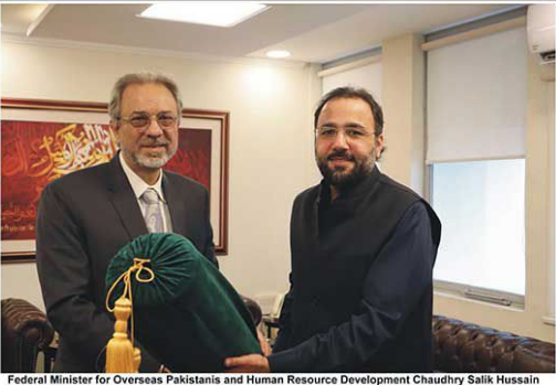
Federal Minister for Overseas Pakistanis and Human Resource Development Chaudhry Salik Hussain presenting souvenir to Turkish Ambassador H.E. Dr. Mehmet Façacı in Islamabad on March 27, 2024.

orders and prescribed rates to reduce prices during the remaining days of Ramadan and on the days of Eid ul-Fitr. He emphasized that Ramadan is a month of blessings and mercy, urging every businessman to contribute to providing relief to the public during these sacred times. Broiler farms and traders announced an immediate reduction of Rs. 10 per kilogram in the price of chicken meat, unanimously agreeing to further decrease prices to the possible extent in coming days. They told that due to the absence of a broiler market in Sargodha, rates are fixed according to Rawalpindi market. They assured that rates in Sargodha Division would be Rs. 10 less than those in Rawalpindi market. They further explained that noted generally, broiler consumption decreases during Ramadan, leading to the production of lesser chicks on farms, but this year an extraordinary increase in prices is being observed due to an increase in consumption.