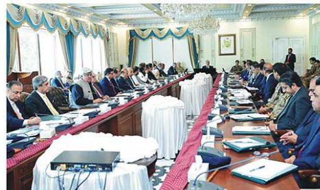
Islamabad: Prime Minister Muhammad Shehbaz Sharif chairs a meeting on measures against the spectrum of illegal activities on 29 March 2024.

Body's reconstitution done on advice of president. Notification is issued after PM Shehbaz's approval.