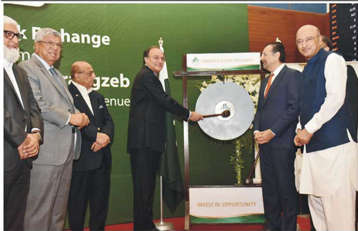
Federal Minister for Finance and Revenue, Muhammad Aurangzeb, Inaugurating the gong ceremony during his visit Karachi Stock Exchange (PSX) on March 29, 2024