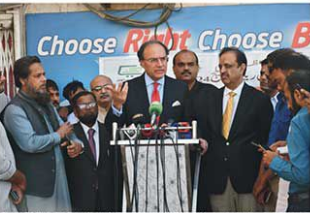
Karachi, 29th March, 2024. Federal Minister for Finance & Revenue Mr. Muhammad Aurangzeb speaking to media during the 10th US-Pakistan Business Council meeting in Karachi to oversee the implementation of the enhanced Ramadan Relief Package.