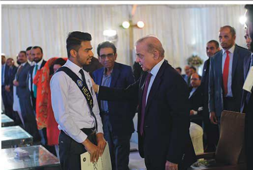
Islamabad: Prime Minister Muhammad Shehbaz Sharif meets a student of Danish School, Jang, Attock in the ceremony at the proposed site of Danish School, Islamabad on 9 April, 2024.

dealing have been registered against them. SHO Sahiwal police station said that the elimination of crimes is my first goal. Drug trafficking has destroyed many families. Vijh area was considered to be the stronghold of drug trafficking. Several drug dealers have been arrested from there. Those involved in drug trafficking do not deserve any exemption, so actions against them will continue.