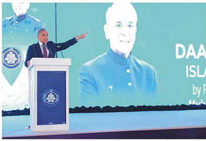
Islamabad: Prime Minister Muhammad Shehbaz Sharif addresses a ceremony at the proposed site of Danish School, Islamabad on 9 April, 2024.

No candidate submitted nomination papers against them for the coveted Senate posts.