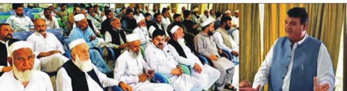
Federal Minister for SAFRON and Kashmir Affairs & Gilgit Baltistan Engr. Ameer Muqam addressing the party workers in Swat on 09-04-2024.