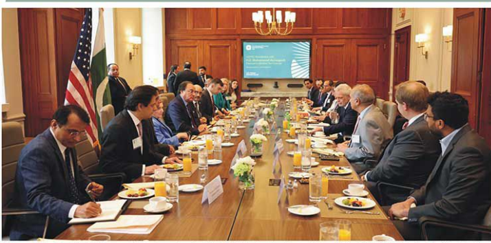
Finance Minister Mr. Muhammad Aurangzeb met with US Pakistan Business Council @ USPBC delegation in Washington D.C. Highlighted gov't commitment to improving business climate & attracting foreign & domestic investments in key sectors including agriculture, IT, mining, & energy.

Justice Qazi Faez Isa has been formed which includes Justice Aminuddin Khan and Justice Justice Jamal Khan Mandokhail. The second bench is headed by Justice Syed Mansoor Ali Shah while Justice Yahya Afridi and Justice Athar Minallah are part of it.