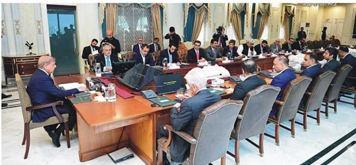
Prime Minister Muhammad Shehbaz Sharif chairs a high level review meeting regarding power sector in Islamabad on 15th of April, 2024.