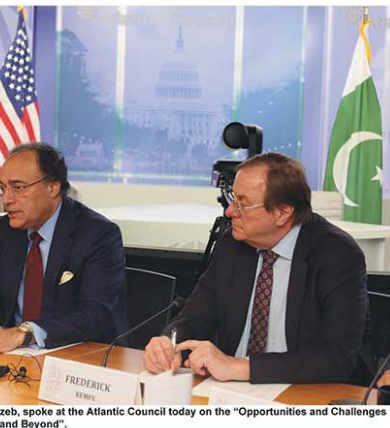
Finance Minister, Mr. Muhammad Aurangzeb, spoke at the Atlantic Council today on the "Opportunities and Challenges for the Pakistani Economy through 2024 and Beyond".

outlook, Aurangzeb said that Pakistan entered this year in much better shape and a lot of it has to do with the nine-month Stand-By Arrangement (SBA) programme. He said that the overall GDP was moving in the right direction, agriculture GDP and services sector are doing well inflation has come down from the peak of 37-38% and the exchange rate is stable, adding that all of this has moved the country in the right direction. "Now we need permanence in the macroeconomic stability hence the discussion with IMF on a larger and extended program. We are also going to be focused on the growth aspects of it because when you are talking to Fund or you are in a Fund program, it's only about stabilisation."