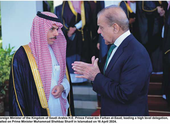
Foreign Minister of the Kingdom of Saudi Arabia H.E. Prince Faisal bin Farhan al-Saud, leading a high level delegation, called on Prime Minister Muhammad Shehbaz Sharif in Islamabad on 16 April 2024.

creating an attractive environment for global investors, particularly those from Saudi Arabia. The foreign minister assured the delegation that the Saudi investment in Pakistan was not just the placement of capital rather it would prove to be instrumental for mutual progress and prosperity. The foreign minister reaffirmed that the Saudi investment in Pakistan would be handled with utmost respect and through institutionalised mechanisms. He told the gathering that Pakistan and Saudi Arabia shared deep-rooted ties anchored in rich Islamic heritage and mutual strategic interests and the Saudi delegation's visit underscored a deep and abiding connection between the two countries.