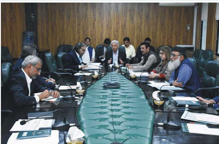
A review meeting of the Fertilizer Review Committee was held under the chairmanship of Rana Tanveer Hussain Federal Minister for M/o Industries & Production and M/o National Food Security & Research.

gas. In Mardan, the regional team disconnected 10 connections on illegal use of gas. The team also imposed fine of Rs 0.44 million against gas theft cases. In Faisalabad the regional team disconnected 01 connection on illegal use of gas and imposed fine of Rs 0.02 million against gas theft cases. In Gujranwala, team disconnected 03 connections on illegal use of gas and imposed fine of Rs 0.27 million against gas theft cases. In Sargodha, team disconnected 01 connection on illegal use of gas. In Gujrat, team disconnected 01 connection on illegal use of gas. In Sahiwal, team disconnected 01 connection on illegal use of gas and lodged 01 FIR against gas thief.