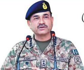
Military warns of stern action against 'malicious propaganda targeting armed forces'

Simultaneously Publishing from Islamabad, Sargodha and Karachi