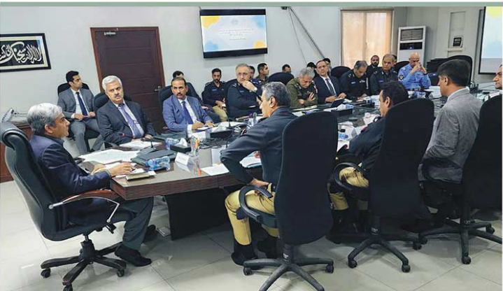
Federal Minister for Interior Mohsin Naqvi chairing the meeting of National Action Plan Coordination Committee at NACTA headquarters Islamabad on April 19, 2024.