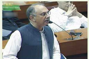
Soon Times Correspondent ISLAMABAD

Opposition in National Assembly raised objections to the oath-taking ceremony of new members of National Assembly (MNAs) in a tumultuous session on Friday.