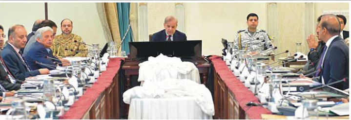
Prime Minister Muhammad Shehbaz Sharif chairs a meeting regarding country wide Anti-smuggling drive in Islamabad on 19th April 2024.