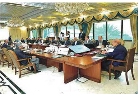
Soon Times Correspondent ISLAMABAD