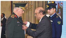
Soon Times Correspondent ISLAMABAD