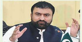
ISLAMABAD (Web Desk)

Balochistan Chief Minister Mir Sarfraz Ahmed Bugti, while talking to reporters after the swearing-in ceremony of his cabinet members at the Governor's House in Quetta on Friday, stated that the ministers would be allotted the portfolios shortly.