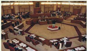
Soon Times Correspondent QUETTA

A 14-member provincial cabinet of Balochistan on Friday took oath in a ceremony held at the Governor House, Balochistan.