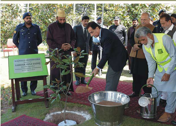
Islamabad 25.04.2024: Speaker National Assembly Sardar Ayaz Sadiq planting a sapling of Magnolia Grandiflora in front of Parliament House.

NARC reserves the right to accept any or reject all bids as per PPRA rules Director (Works & Estate Management NARC, Islamabad) Ph: 051- 9255057/ Ext. 9073-3441-3442