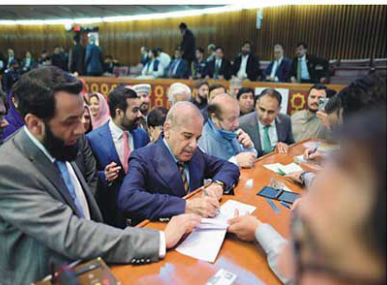
Prime Minister Muhammad Shehbaz Sharif casting his vote at the Senate elections at Parliament House