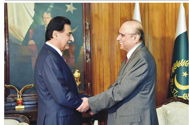
Speaker National Assembly, Sardar Ayaz Sadiq, called on President Asif Ali Zardari, at Aiwan-e-Sadr,

•Develop and enforce professional standards in privatized sectors to ensure the delivery of high-quality services and maintain professionalism among employees. •Establish capacity-building programs and training initiatives to bridge skill gaps and enhance the expertise of the workforce in privatized entities. •Implement performance monitoring and evaluation systems to measure the efficiency and effectiveness of privatized services, while also incorporating customer feedback and satisfaction surveys.