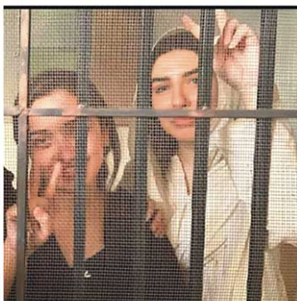
police station and City police station on May 9. Further hearing will be held on April 16.