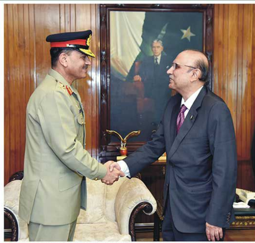
Chief of Army Staff (COAS), General Syed Asim Munir, NI (M), called on President Asif Ali Zardari, at Alwan-e-Sadr.