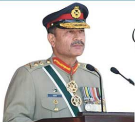
Army chief Asim Munir invites cricketers for Iftaar dinner