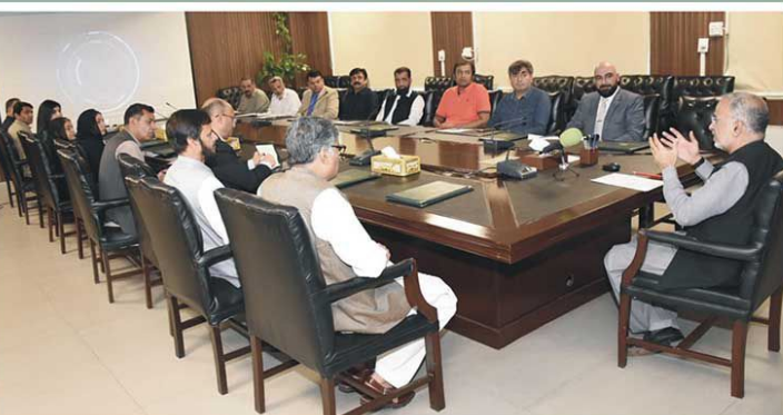
Islamabad, April 05, 2024: Federal Secretary IPC chaired a meeting for Launching of the E-licencing portal for provision of Online services to users of travel and Hospitality trade in ICT and GB

"It is our prime focus to build a strong umbrella, a strong buffer in the form of a substantial quantum of forex reserves which will help us when the cycle turns or when it rains heavily," RBI Governor Shaktikanta Das said on Friday. In the week that the foreign exchange data pertains, the rupee had hit a record low of 83.45 against the dollar, but clocked minor weekly gains.