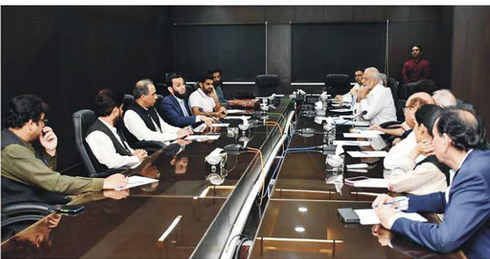
Mr. Attaullah Tarar, Federal Minister for Information and Broadcasting in a meeting with office-bearers of Pakistan Broadcasters Association (PBA) in Karachi on April 5, 2024.

He said no doubt, the parents were the biggest blessings, but the Holy Prophet Muhammad PBUH was also born with no father and his mother passed away when he was only six