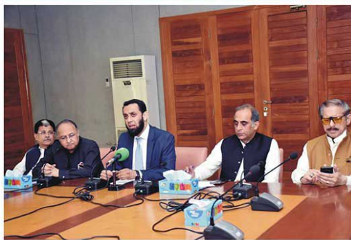
Mr. Attaullah Tarar, Federal Minister for Information and Broadcasting in a meeting with office-bearers of APNS in Karachi on April 5, 2024.

The husband said he had a brief quarrel with his wife over a domestic issue and had no idea as what have they had eaten in his absence.