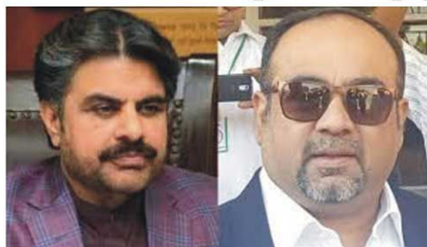
Soon Times Correspondent KARACHI