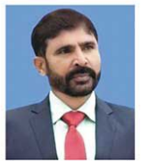
Dr. Muhammad Akram Zahoor

results with some limited measures introduced to enhance transparency and accountability in government. However, broader systemic changes remain elusive as the Kremlin maintains a tight grip on power and resists substantial shifts towards greater democratization. The future of opposition politics and political reforms in Russia hinges on complex dynamics between state controls societal demands for change and international pressure for respect of democratic norms.