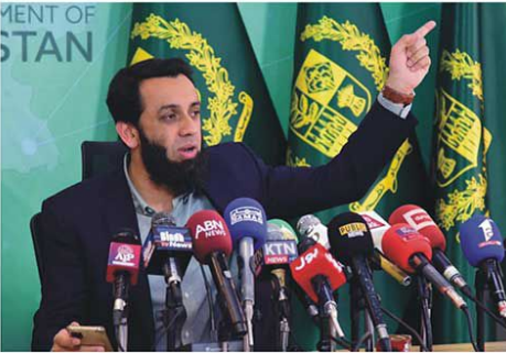
Soon Times Correspondent Islamabad

Last year, Imran had challenged the army chief to prove any corruption case against him and his wife.