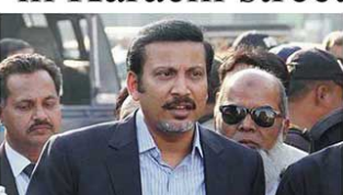
Soon Times Correspondent KARACHI