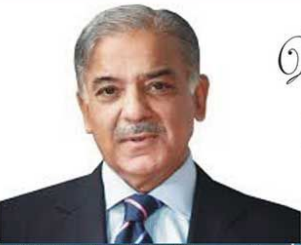
PM Shehbaz Sharif leaves for Makkah to perform Umrah

Simultaneously Publishing from Islamabad, Sargodha and Karachi