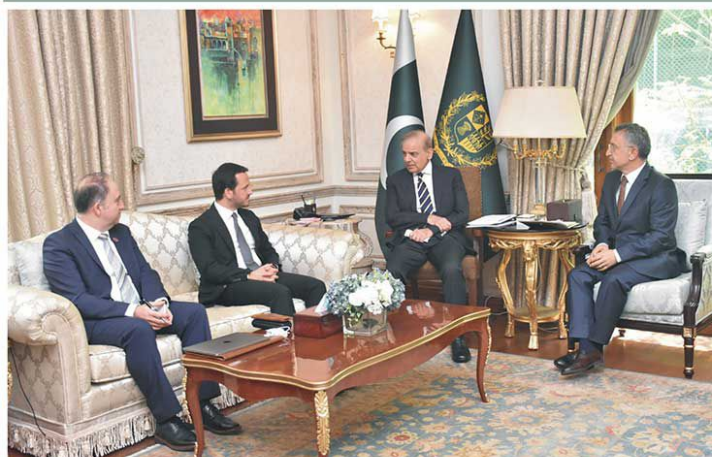
Lahore: A delegation of Istanbul Grand Airport (IGA) calls on Prime Minister Muhammad Shehbaz Sharif on 6 April 2024.

the task with remarkable courage and bravery. In remembrance of the martyrs, the Yadgar-e-Shuhada monument was erected on the high peak of Siachen. "In remembrance of the martyrs, a monument was erected at the lofty heights of Siachen as a tribute. Today, the nation pays homage to these martyrs of the Gyari Sector, whose supreme sacrifices will always be remembered," stated the ISPR.