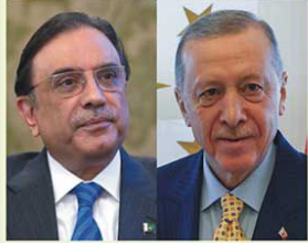
Soon Times Correspondent ISLAMABAD

President Ashraf Zardari held a telephonic conversation with Turkish President Recep Tayyip Erdogan on Sunday, the President's House Press Wing said in a statement.