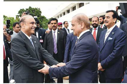
President Asif Ali Zardari being received by the Prime Minister of Pakistan, Muhammad Shehbaz Sharif, upon his arrival at Parliament House, Islamabad on April 18, 2024.

Addressing joint session, Zardari says fostering atmosphere of mutual respect must to overcome challenges