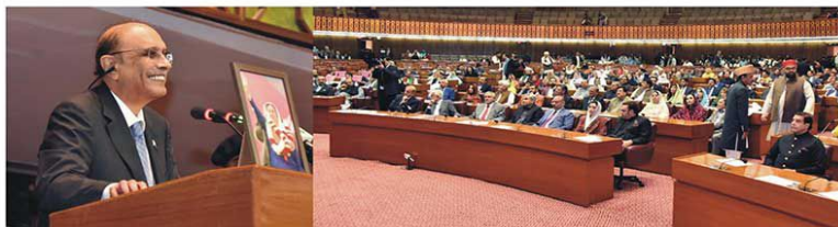
President Asif Ali Zardari addressing the Joint Session of the Parliament at the beginning of the Parliamentary year, in Islamabad on April 18, 2024.

of the Babri Mosque to build the Ram Mandir or by exerting influence in the Maldives to bolster Lakshadweep's position. With all the major opposition party leaders in jail, strong connections with business giants, controlled digital and print media, strong media campaigns, and provoking nationalism and religiousness, Indian democracy seems to be endangered.