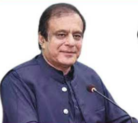
PTI nominates Shihbil Faraz to be opposition leader in Senate

Simultaneously Publishing from Islamabad, Sargodha and Karachi