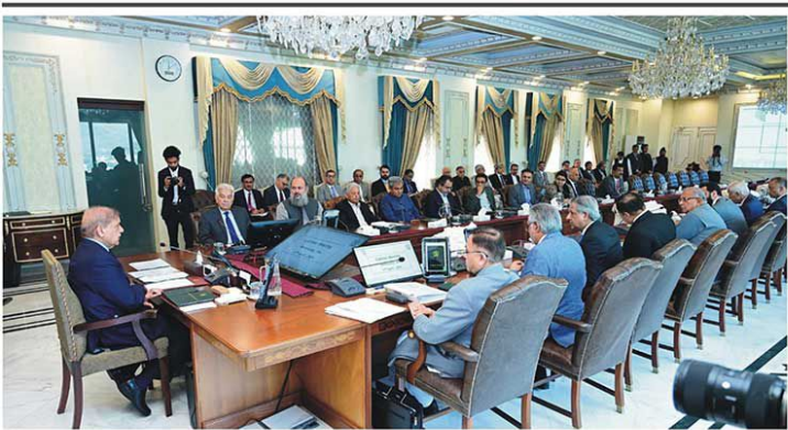
Islamabad : Prime Minister Muhammad Shehbaz Sharif chairs a meeting of the Federal Cabinet on 17 April, 2024.

political and social organizations here have drawn the attention of the higher authorities to this aspect, but till now no one has paid attention to this aspect. The residents of Soon Valley have demanded from the Chief Minister of Punjab to provide a special grant for the construction and repair of the roads of Soon Valley.