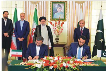
Islamabad: Prime Minister Muhammad Shehbaz Sharif and President of Iran E.A. Raisi witness signing of MoU of cooperation in different fields between Iran and Pakistan on 22 April, 2024.

The agreements include cooperation in security and judicial assistance in civil matters