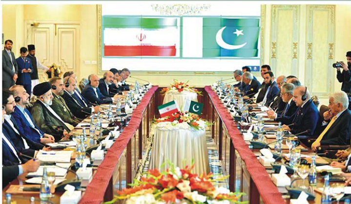
Islamabad: Prime Minister Muhammad Shehbaz Sharif and Iranian President H.E. Dr. Seyyed Ebrahim Raisi in a delegation level talks between Iran and Pakistan on 22 April, 2024.

Karachi division to "avoid inconvenience to the general public" as foreign dignitaries, including the Iranian president, are visiting Pakistan. The Foreign Office said that the Iranian president would undertake an official visit to Pakistan from April 22 (Monday) to April 24 (Wednesday). "The Iranian president will be accompanied by his spouse and a high-level delegation comprising the foreign minister and other members of the cabinet.