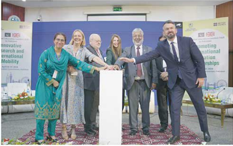
Soon Times Correspondent Islamabad: