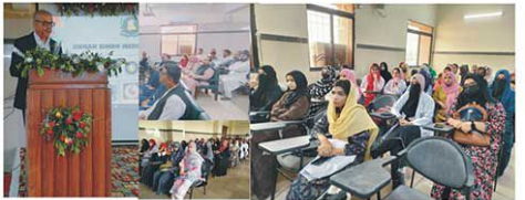
Soon Times Correspondent Karachi: