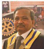
BY SALAUDDIN CHOUDHRY

For ages & eras, languages came about from peoples and places of sorts both independently and needs-based cross-fertilization of diverse and even disparate customs, traditions & values. These in turn found and advanced orally and in black & white by writers of various interests & backgrounds led gradually to language-dependent literature of different kinds & forms. Human civilization since time immemorial has been cognizant of and accordingly served time & efforts in developing the needed medium of communication which resulted in words & phrases founded on personal & sound-based signs used by animate objects in particular human beings culminating into a language of expression. Today, as languages throughout the world developed in shapes & formats, we see an unlimited world of languages alongside literatures enriched by their unabated & definitive inculcation through human cultural pursuits giving identity to each one of them, recognized and esteemed the world over. No wonder, in this respect, one sees with awe and values all languages & literatures in man's modern world. And, here, the United Nations fortunately ensures valued continuity & development of these modes of human expression as prevalent and as required to preserve and promote any of them from going extinct.