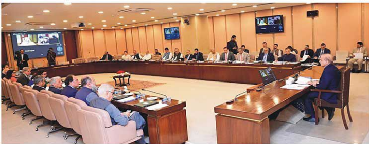
Islamabad: Prime Minister Muhammad Shehbaz Sharif chairs a special meeting of the Federal Cabinet on 9th May, 2024.

They further said that people love the Pakistan Army. They said the love of the army cannot be erased from the hearts of the people.