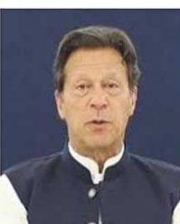
Soon Times Correspondent RAWALPINDI "Incarcerated Pakistan Tehreek-e-Insaf (PTI) founder Imran Khan has assigned an 'important responsibility' to former president Dr Arif Alvi, who had been making efforts to bridge the gap between the establishment and former ruling party, revealed the party's Secretary General Omar Ayub Khan on Thursday. The development came a day after the PTI founding chairman turned down the military's demand to apologise for the May 9 violent and distanced his party from the events and protests that broke out in the country last year soon after his arrest. Addressing a press conference flanked by Alvi outside the Adiala Jail in Rawalpindi, Ayub said: "The PTI founder has assigned important responsibility to Arif Alvi [during his maiden meeting with Khan after leaving the Presidency]. For his part, the former president said: "The PTI founder is ready to render [more] sacrifices [for the country]."