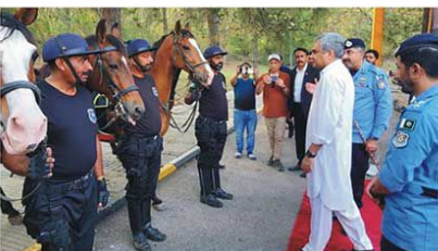
Soon Times Correspondent Islamabad Interior Minister Mohsin Naqvi on Thursday formally inaugurated the Margalla Trails Patrol Unit, a new security system established in just seven days.