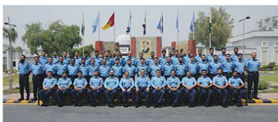
Soon Times Correspondent Karachi