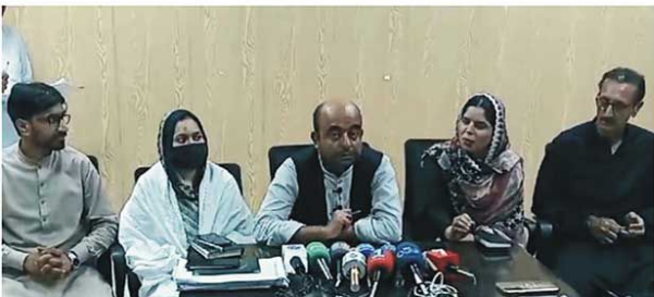
Soon Times Correspondent Islamabad:

In a groundbreaking initiative aimed at addressing gender disparities in the technology sector and advancing women's economic empowerment, the Korean International Cooperation Agency (KOICA) has signed a project providing a generous funding of USD 8 million to support UN Women's Economic Empowerment (EEM) project. The project aims to increase digital enablement and innovation among women and girls aged 18 to 35 in Pakistan. The project marks a milestone in empowering young women economically. The project adopts a