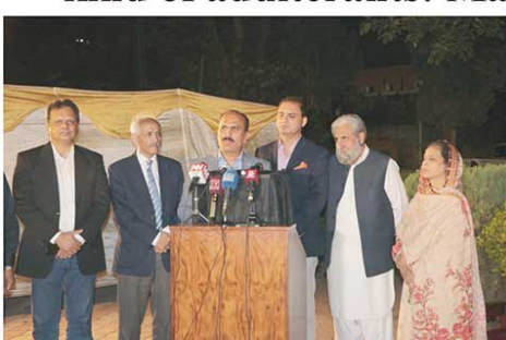
Soon Times Correspondent Rawalpindi: