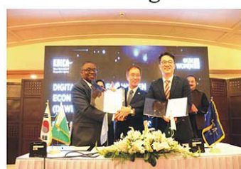
Soon Times Correspondent Islamabad:

In a groundbreaking initiative aimed at addressing gender disparities in the technology sector and advancing women's economic empowerment, the Korean International Cooperation Agency (KOICA) has signed a project providing a generous funding of USD 8 million to support UN Women's Economic Empowerment (EEM) project. The project aims to increase digital enablement and innovation among women and girls aged 18 to 35 in Pakistan. The project marks a milestone in empowering young women economically. The project adopts a comprehensive approach, focusing on two key strategies: enhancing opportunities in the technology sector and fostering an enabling environment for young women to thrive in technology-related fields such as IT-enabled services, software development and data analytics. His Excellency Park Ki-Jun, Ambassador of Korea to the Islamic Republic of Pakistan expressed, "Government of Korea is proud