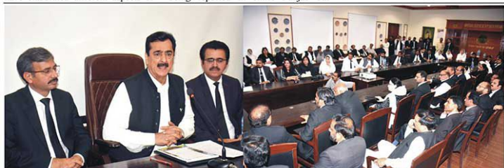
Multan: Chairman Senate Syed Yusuf Raza Gilani in a meeting with the delegations of Multan Hightcourt Bar Association and District Bar Association here at Circuit House today.

She also said she missed her great mother every day and she is thankful to her mother, Kulsom Nawaz, for her love and kindness. Punjab CM attributed her achievements to her, stating, 'I am here in this office of the first chief minister of any province due to my mother's prayers.' She highlighted that those who serve and honor their mothers are successful in this world and the hereafter.