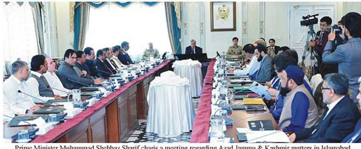
Prime Minister Muhammad Shehbaz Sharif chairs a meeting regarding Azad Jammu & Kashmir matters in Islamabad

promoted instead. The provincial government, by flouting the LHC's ruling, held a balloting to give bikes to the students in interest-free and soft instalments under the Chief Minister's Youth Initiative programme at the SOF office on Saturday. Expressing her displeasure over the judgment, the CM said: "We introduced the bike scheme for students. LHC judge stopped it." Referring to the honourable judge's remarks on the proceedings, the chief minister said that she could not stop laughing when she heard the verdict. "It was said that if bikes were distributed among the children [students],