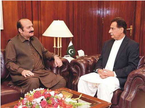
Islamabad: May 14, 2024: Chairman Prime Minister's Youth Programme Rana Mashhood Ahmed Khan called on Speaker National Assembly Sardar Ayaz Sadiq.