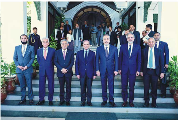
Group photo of Prime Minister Muhammad Shehbaz Sharif and Foreign Minister of Turkiye Hakan Fidan in Islamabad on 20th May 2024.

Islamabad were nominated for key positions within WPJP. WPJP also announced an upcoming donor conference scheduled for early June 2024 at the Convention Center. This conference aims to bring together government officials and potential donors. Following this, international-level donor conferences are planned to be held in the United Kingdom, the United States, and Canada, reflecting the global interest in investing in Pakistan's future. WPJP continues to be actively involved in tackling various challenges such as education, healthcare, and women's rights. The organization also focuses on addressing the issues faced by overseas Pakistanis. Through these efforts, WPJP reaffirms its commitment to advancing Pakistan's development agenda and promoting peace and prosperity across the nation.