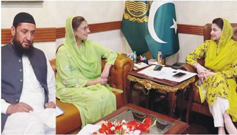
Soon Times Correspondent LAHORE Punjab Chief Minister Maryam Nawaz has asserted that every sector related to public welfare is her priority.