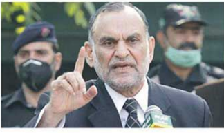
would not function properly unless judges and generals ensure adherence to the legal framework.