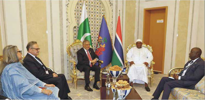
Deputy Prime Minister and Foreign Minister Senator Mohammad Ishaq Dar called on the President of the Republic of the Gambia, Adama Barrow, on the sidelines of the 15th OIC Islamic Summit Conference, in Banjul, the Gambia on May 05, 2024.