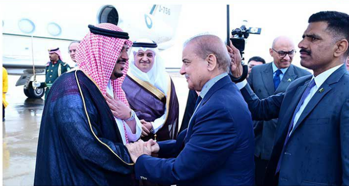
Riyadh: Prime Minister Muhammad Shehbaz Sharif departs of Pakistan after participating in a special meeting of the World Economic Forum.

parliaments of both countries, the speaker noted, "Parliamentary diplomacy is quintessential in bringing two nations closer which are already tied in eternal religious and historic bonds". He said that the Pak-Qatar friendship group in the National Assembly of Pakistan would be fully activated to bring Parliaments and people of both the countries closer. During the meeting, he also mentioned the invitation extended to the Speaker of the Shura Council of the State of Qatar. Expressing his satisfaction over the economic cooperation between Pakistan and Qatar, the speaker said that investors from Qatar could benefit from investment opportunities in Pakistan by investing in various sectors especially the energy and manufacturing sectors.