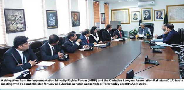
A delegation from the Implementation Minority Rights Forum (IMRF) and the Christian Lawyers Association Pakistan (CLA) had a meeting with Federal Minister for Law and Justice senator Azam Nazeer Tarar today on 30th April 2024.