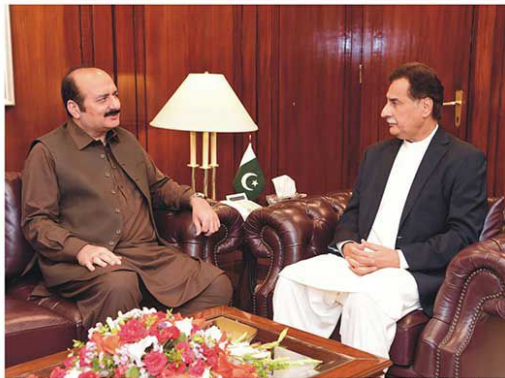
Islamabad: May 14, 2024: Chairman Prime Minister's Youth Programme Rana Mashood Ahmed Khan called on Speaker National Assembly Sardar Ayaz Sadiq.

on the apex court's website. At the outset of the hearing, both the National Accountability Bureau (NAB) prosecutor general and the lawyer representing the Punjab government stated that they would adhere to the federal