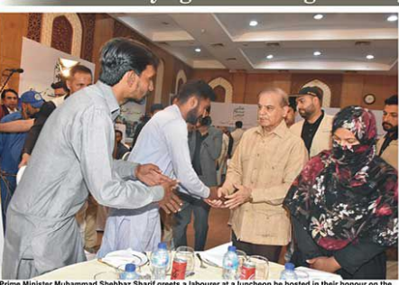
Prime Minister Muhammad Shehbaz Sharif greets a labourer at a luncheon he hosted in their honour on the occasion of Labour Day in Lahore on 1st May 2024.

PM says govt striving to bring substantial changes in economy