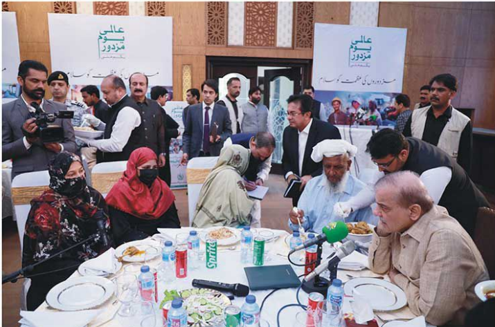
Prime Minister Muhammad Shehbaz Sharif interacting with families of labourers at a luncheon he hosted in their honour on the occasion of Labour Day in Lahore on 1st May 2024.

challenges faced by commuters, including overcrowding and insufficient coverage of certain areas. Last week, Prime Minister Shehbaz Sharif had announced the inclusion of 150 buses into Karachi's transport network during his inaugural visit to the city. The premier commended the efforts of the provincial government in enhancing transportation services for the public. Earlier this month, Karachi introduced the Pink Bus service catering exclusively to women and girls, offering free rides for the first two months and subsequently at a nominal fare of RS50 per passenger. PPP Women's Wing Chairperson MPA Farah Talpur inaugurated the service, lauding its role in empowering women and fostering development and prosperity.