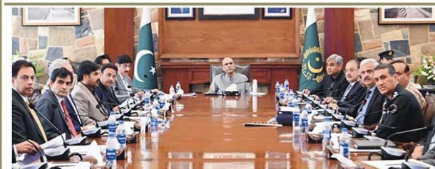
President Asif Ali Zardari being briefed about the overall security, law and order situation of the Sindh province, at the Chief Minister House, Karachi on May 1, 2024.