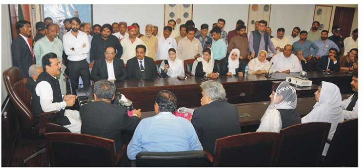
Multan: 16-05-2024A delegation of lawyers called on the Chairman Senate Syed Yusuf Raza Gilani at the circuit house.