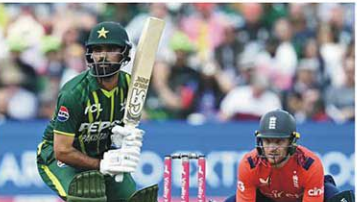
Fakhar Zaman in action during a T20I match.

DUBAI Left-hand batsman Fakhar Zaman has risen six places to 51st in latest T20I rankings following his innings of 45 from just 21 deliveries against England in going series. While portions of England's home series against Pakistan have been hampered by inclement weather, that has not stopped players from both sides from making inroads on the latest rankings update just days out from the start of the T20 World Cup in the West Indies and USA. England captain Jos Buttler rises one