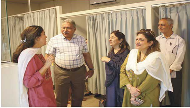
Soon Times Correspondent Karachi