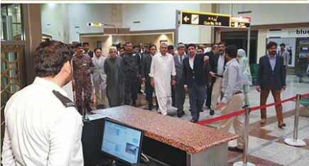
Federal Minister for Interior, Mohsin Naqvi and Federal Minister for Aviation and Defence, Khawaja Muhammad Asif inspecting the immigration counters during their visit to Atama Iqbal International Airport, Lahore.

them after intriguing. Police patrols in the area are completely closed, giving criminals a free pass. Every visiting SHO allows drug dealers to sell drugs by charging extortion. The new DPO should hold an open court in the Satellite Town area of the Police Station to listen to the problems of the residents of the suburb so that the exploits of the incompetent SHO can be brought to light.