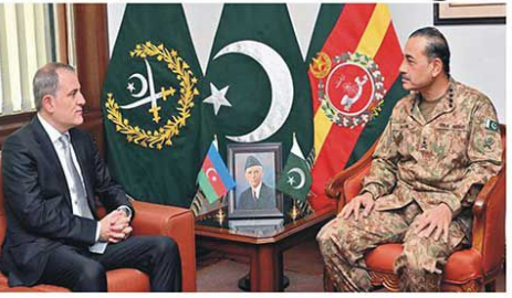
Soon Times Correspondent RAWALPINDI Azerbaijan Foreign Minister Jeyhun Bayramov, who is on a visit to Pakistan, called on Chief of Army Staff General Syed Asim Munir on Friday and discussed matters

of mutual and bilateral interest, including regional peace and stability. The Azerbaijan minister visited the General Headquarters (GHQ) here and held in-depth discussions with the COAS. Gen Asim emphasized Pakistan's longstanding fraternal ties with Azerbaijan and reiterated unwavering commitment to providing comprehensive assistance and cooperation in the fields of defense and security. The COAS praised the Azerbaijani Armed Forces for their exemplary professionalism and valor. The visiting dignitary expressed his sincere appreciation for Pakistan's steadfast support to Azerbaijan and acknowledged the country's pivotal role in maintaining regional stability. Related Topics