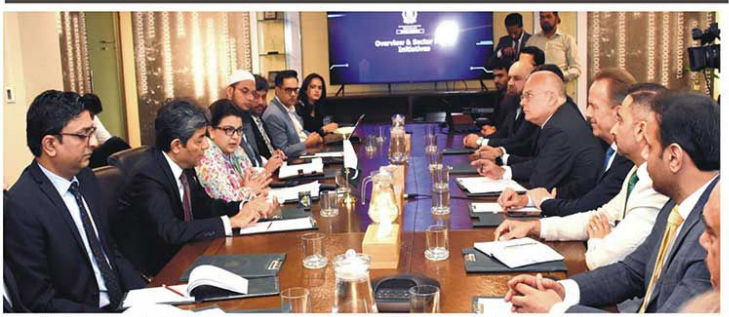
Minister of State for IT and Telecommunication Ms. Shaza Fatima Khawaja addressing Roundtable on IT and Digitalisation with Swedish companies in Islamabad on June 27, 2024.

necessitates protective measures during severe storms. Authorities in flood-prone districts are advised to clear rivers and canals, and urged against crossing them during rainy and flood conditions. Besides strict enforcement of laws prohibiting bathing in rivers and canals is also recommended. The alert aims to ensure readiness; rescue agencies and drainage authorities are urged to remain vigilant, as per DG PDMA. The public is advised to comply with government instructions and contact the PDMA helpline 1129 in emergencies.