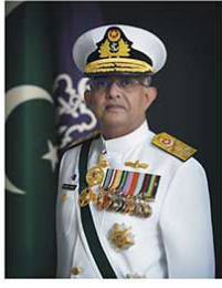
Soon Times Correspondent

for the WED is 'Land Restoration, Desertification, and Drought Resilience'. The occasion will serve as a stark reminder of the urgent need to protect our land, sea, and everything in between. Pakistan's long coastline provides access to rich resources of livelihood for millions of people. Our marine resources are a treasure trove of biodiversity that support a vast array of marine life, from majestic sea turtles to colourful coral reefs. However, our coastal areas and marine eco-system is faced with grave threats from human activities that include marine pollution, such as oil spills and industrial effluents endangering marine life and contaminating the food chain. Overfishing and unsustainable fishing practices are depleting fish populations, damaging the delicate balance of our marine ecosystem. Rising sea levels are causing coastal erosion which is accentuated by deforestation and construction activities that threaten the very