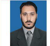
By: Iftikhar Uddin Anjum