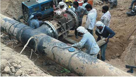
Soon Times Correspondent Lahore: Sui Northern has successfully achieved three significant milestones to enhance gas transmission and distribution. The bifurcation of Lahore Region into

This project addresses low-pressure issues, improves network operations, and reduces gas losses. The isolation of Rawalpindi and Islamabad has been completed to ensure better operational efficiency for Rawalpindi and Islamabad. A 24-inch line was constructed along Kashmir Highway, improving gas flow management and enhancing pressure and flow for both cities. New 24-inch and 18-inch lines were built to address low-pressure issues in the Red Zone and Blue Area of Islamabad, along with an 18-inch line from SMS Ranyal in Rawalpindi. Separate feeds for the twin cities will cater for more accurate UFG calculations and efficiency improvements. These projects have been completed by June 30, 2024, ahead of the December 2024 deadline, aiming to significantly improve the system operations.