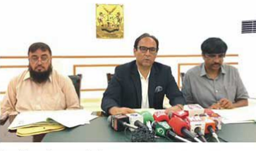
Soon Times Correspondent Sargodha: