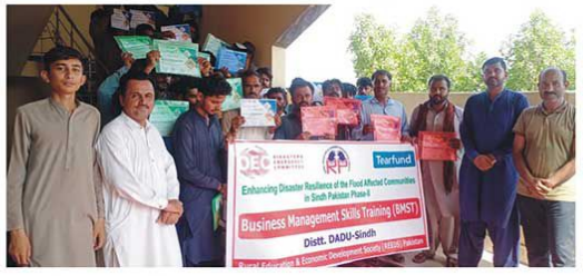
Soon Times Correspondent Dadu:

REEDS with the support of Tearfund-DEC is implementing "Enhancing Disaster Resilience of the Flood Affected Communities in Sindh Pakistan-Phase-II" in District Dadu. In order to create awareness and minimize the effects of waterborne diseases, REEDS raised community awareness around WASH through interaction with street theaters. Street Theaters were performed in project villages of UC-Kamal Khan and UC-Bahawalpur. Street theater is a powerful and