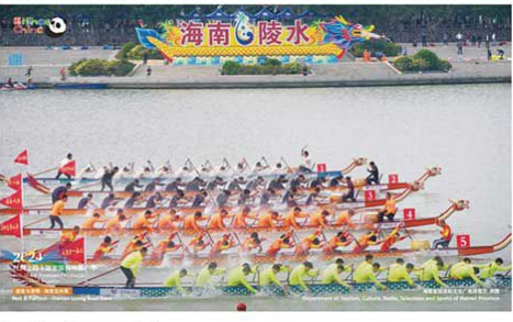
Soon Times Correspondent Islamabad:

China Cultural Center in Pakistan and the Cultural Office of the Embassy of the People's Republic of China in Pakistan have officially launched Nihao! China-2024 Silk Road Tourism Overseas Promotion Online Season in Pakistan. "Nihao! China"-2024 Silk Road Tourism Overseas Promotion Season series of activities were organized by the Network of International Cultural Link Entities (NICE), in collaboration with China