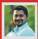
By: Saif Awan