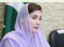
Soon Times Correspondent LAHORWE

Punjab Chief Minister Maryam Nawaz on Friday expressed grief over the loss of lives caused by downpour in Punjab. She expressed sympathy with the bereaved families of those who were killed by electrocution and roof collapse incidents while assuring the families of full support during this predicament. She also directed the authorities to provide best medical facilities to the people injured due to heavy rains and deluge.