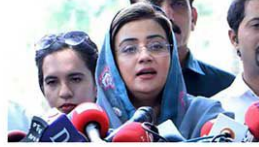
Soon Times Correspondent LAHORE

Punjab Information Minister Azma Bokhari has asserted that digital terrorism on social media is posing threat to the state. Talking to media outside the Lahore High Court (LHC), she advocated for regulations as social media runs under rules across the world. She raised the question on the social media operation without any rules and regulations as anyone could post anything without any accountability.