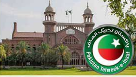
Soon Times Correspondent Lahore

The Lahore High Court has disposed of application of Pakistan Tehreek-e-Insaf (PTI) seeking permission of public gathering at Minar e Pakistan on 14 August in the light of deputy commissioner's report. The LHC's Justice Muzammil Akhtar Shabbir heard the application of Akmal Khan. Advocate Habibullah representing Lahore DC appeared before the court. He submitted the report of district administration related to public gathering permission. It was mentioned in the report that the 14 August day was an independence day and citizens celebrate the national day at the Minar e Pakistan. In the wake of law and order situation, permission for public gathering could not be allowed. Pakistan Peoples Party and Istehkam-e-Pakistan Party had also submitted the application for the events. The court directed the petitioner to file a new application in the light of the DC report.