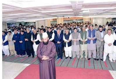
Soon Times Correspondent ISLAMABAD Prime Minister Shehbaz Sharif said on Friday the killing of Hamas leader Ismail Haniyeh in Iran was the worst incident of oppression by the Israeli state. Addressing a federal cabinet meeting in Islamabad, the premier said he had condemned the murder of Haniyeh in a meeting with his government's coalition partners and urged the global organisations to take action against the atrocities of the Zionist state on the innocent Palestinians. Later, funeral prayer in absentia for the late Hamas leader was also held in the Parliament

House, which were attended by the premier and cabinet ministers. PM seeks unity to solve electricity crisis. Speaking about the woes of electricity consumers, the prime minister said the time had come to assuage the concerns of the power consumers by stopping power thefts forthwith, adding that Chief of Army Staff Gen Asim Munir had helped the government in eradicating this menace of power theft. He also recalled the Chinese investment in power sector during former premier Nawaz Sharif's previous term which helped him reduce power outages which would be 20-hour long across the country. He called for avoiding politics on electricity crisis, adding that everyone across the political divide was rallying behind the government's agenda of reducing electricity crisis. He also criticised the Pakistan Tehreek-e-Insaf for not being able to build a single dam in Khyber Pakhtunkhwa, claiming that all promises of building dams were fraudulent and misleading.