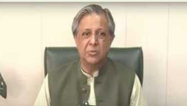
Soon Times Correspondent ISLAMABAD

Federal Law Minister Azam Nazeer Tatar on Friday announced a grant of Rs5 million for each affected family of the missing persons. He said a number of complex factors were behind the issue of missing persons and the state had made a historic decision to provide the much-needed relief to the victim's families. The policy would be applied to the family of the person who has been missing for more than five years. The law minister stated that the package was intended to support and not compensation. "If the missing person returns, there will be no claim to the amount," he added. The minister reiterated that the cabinet had approved a Rs5 million support package. He said the federal government had approved the grant as this step might alleviate the sufferings of the bereaved families. He said the state is committed to solving the problem of missing persons using all available resources and many such cases have been resolved through Enforced Disappearance Inquiry Commission. In order to carry forward this determination, the government has started the 'National Consensus & Legal Resolution (NCLR) of Missing Persons'.